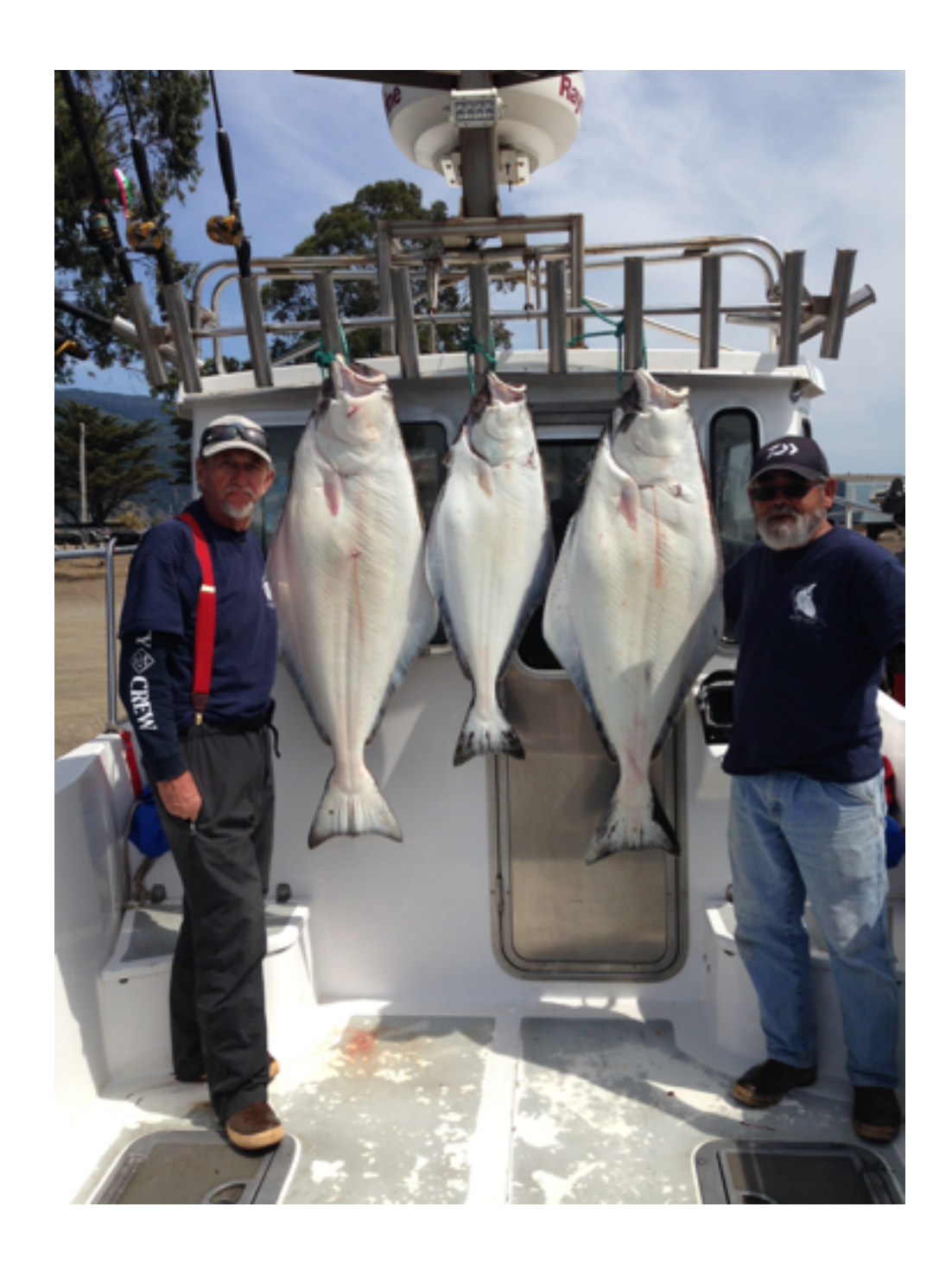
The big halibut went 62.7and 62.9 pounds